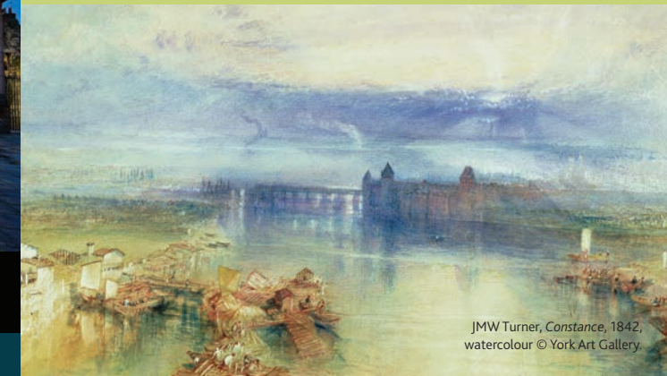
JMW Turner, Constance , 1842, watercolour © York Art Gallery.