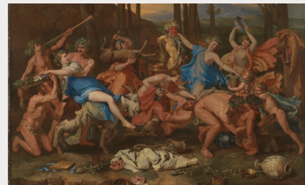
Nicolas Poussin, The Triumph of Pan, 1636 Bought with contributions from the National Heritage Memorial Fund and the Art Fund, 1982.

York Art Gallery are excited to be displaying The Triumph of Pan by Nicolas Poussin, one of the most important and influential painters of the 17th century. This display is part of The National Gallery Masterpiece Tour 2019 sponsored by Christie's.