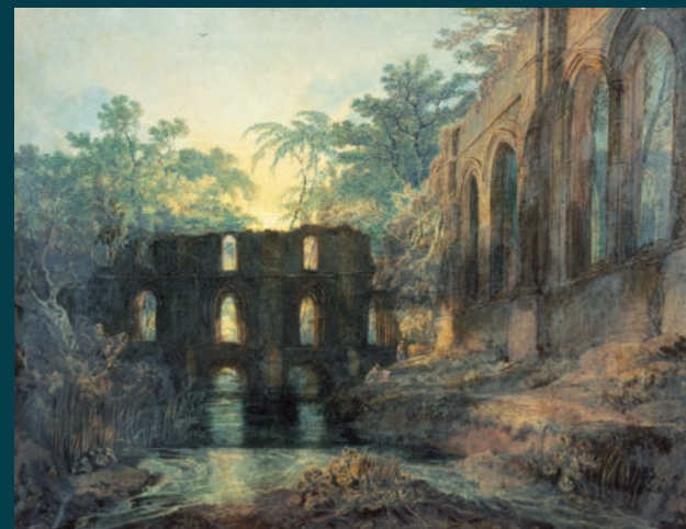
JMW Turner, The Dormitory and Transept of Fountains Abbey – Evening , 1798.

This major exhibition marks the 200th anniversary of the birth of artist and critic John Ruskin. It will consider Ruskin's relationship with JMW Turner, as well as his concerns about the environment and wellbeing. This partnership exhibition between York Art Gallery and Lakeland Arts will showcase our Turner and Ruskin works together for the first time, complemented by substantial loans from regional and national collections.